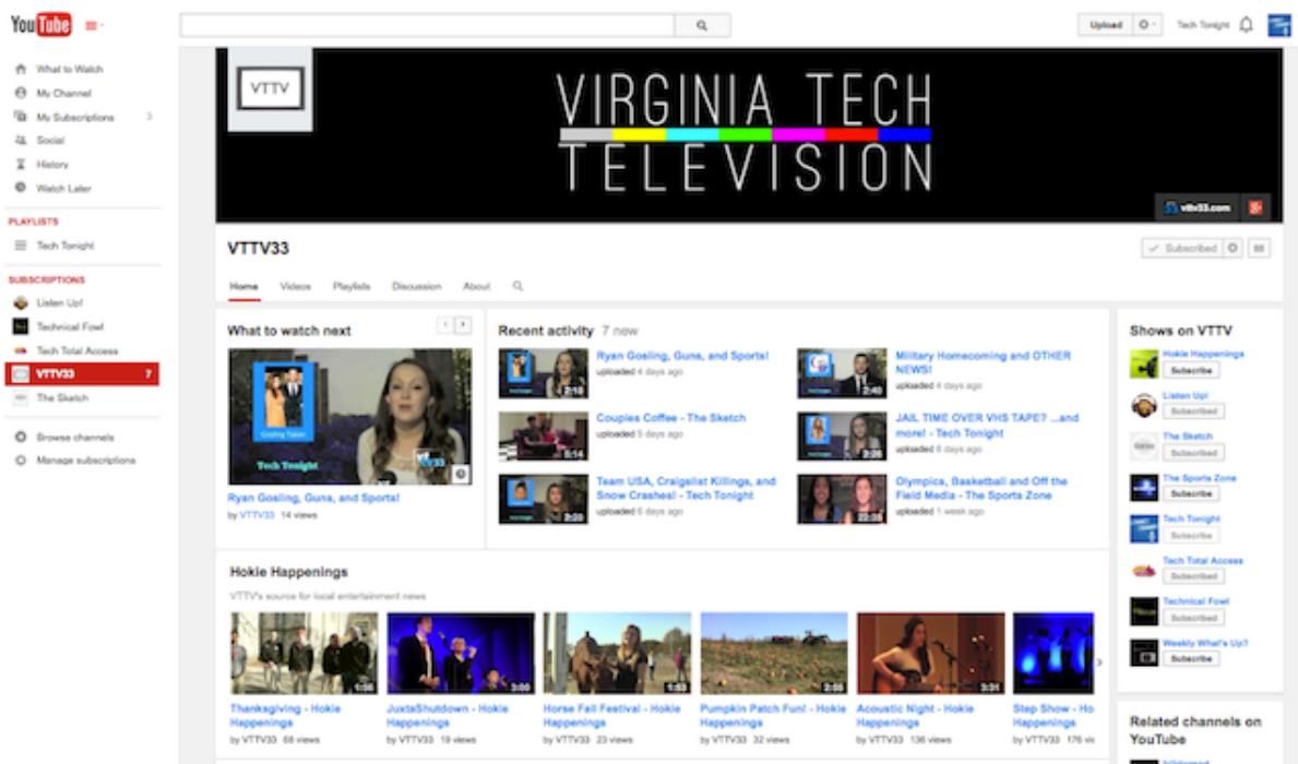
Figure 1: VTTV's main YouTube page, displaying shows from each department.